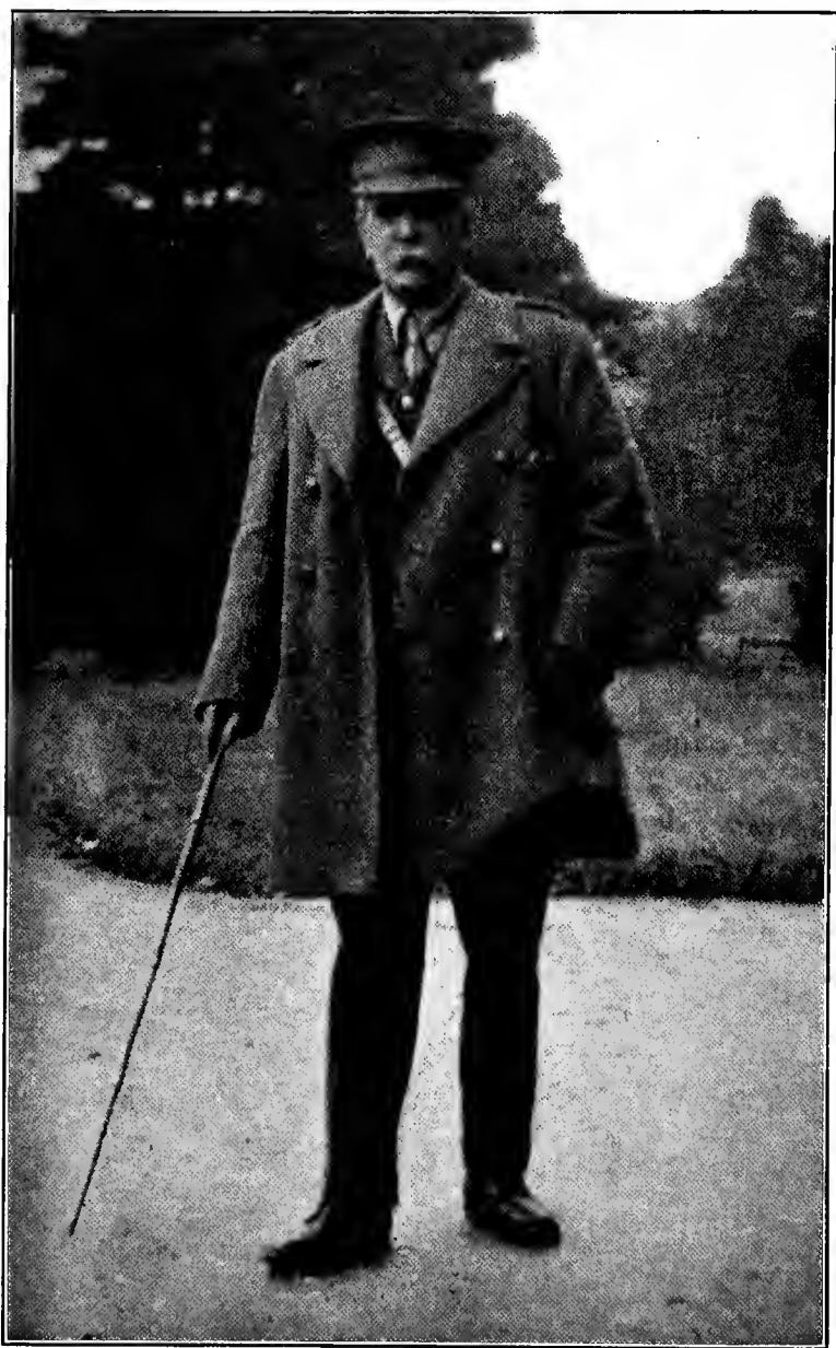
A memory of Canadian Hospital Cleveland Munster 1915-16